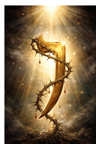
Created with ChatGPT

The vov 1 represents attachment, connection, and bringing things together. It can act as a bridge between the spiritual and the physical worlds. Grammatically, it's a conjunction. That means it connects thoughts, ideas and concepts. It can also function as either a consonant or a vowel, demonstrating its ability to change its role. This means vov 1 can show up as a conduit between God and man, or as a thorn in the flesh sent by Satan to torment. It begs the question, what are we attached to? And what might be trying to get its hook in us?